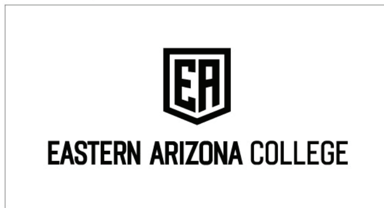
Eastern Arizona College Grayscale Logo version