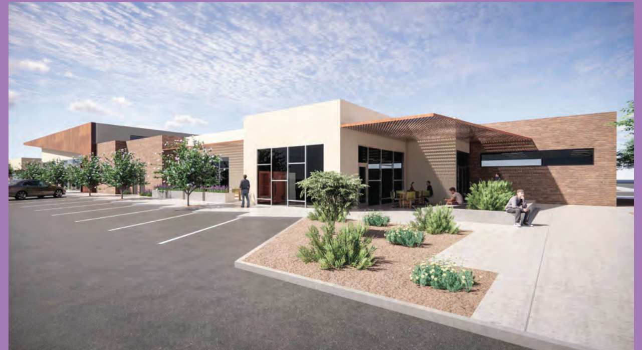
Eastern Arizona College's new cosmetology facility will include 12,000 square feet dedicated to cosmetology and 7,300 square feet of medical space. (Rendering courtesy of EAC).

EAC is investing in a new state-of-the-art facility to upgrade its Cosmetology Program and partnering with Mount Graham Regional Medical Center to offer an accessible medical clinic. Part of the new facility will be leased to the hospital for the medical clinic, while the Cosmetology building will enable the College to expand enrollment in its popular Cosmetology Program. Currently, the program can accommodate 70 students, but demand has consistently exceeded capacity. The new building will increase capacity to 130 students, helping meet the growing need for trained cosmetologists in the region.